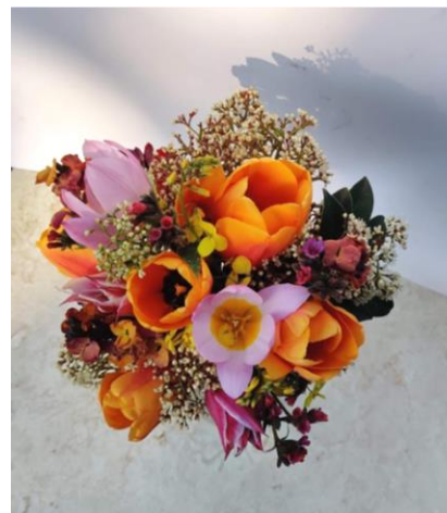
Skimmia japonica, Pulmonaria "Raspberry Splash, Epimedium sp.

This was more of a challenge than I thought! I tried to match all the criteria listed under this type. (Who knew making a circle, and trying not to group would be so