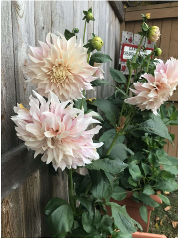
Cafe au Lait Dahlia

This beauty is growing in Phyllis Woodward's garden.