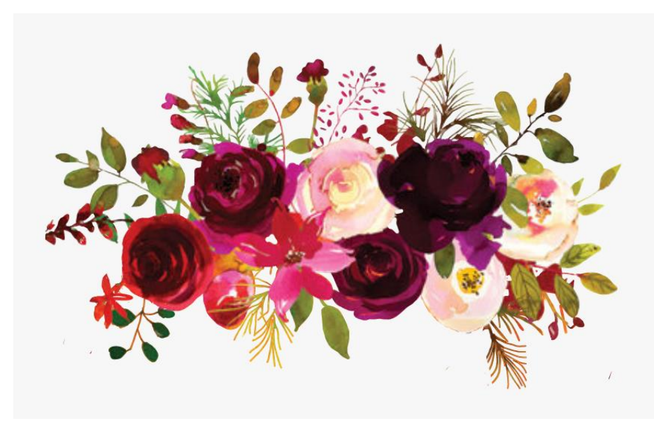
"FALL in Love with Flower Shows"