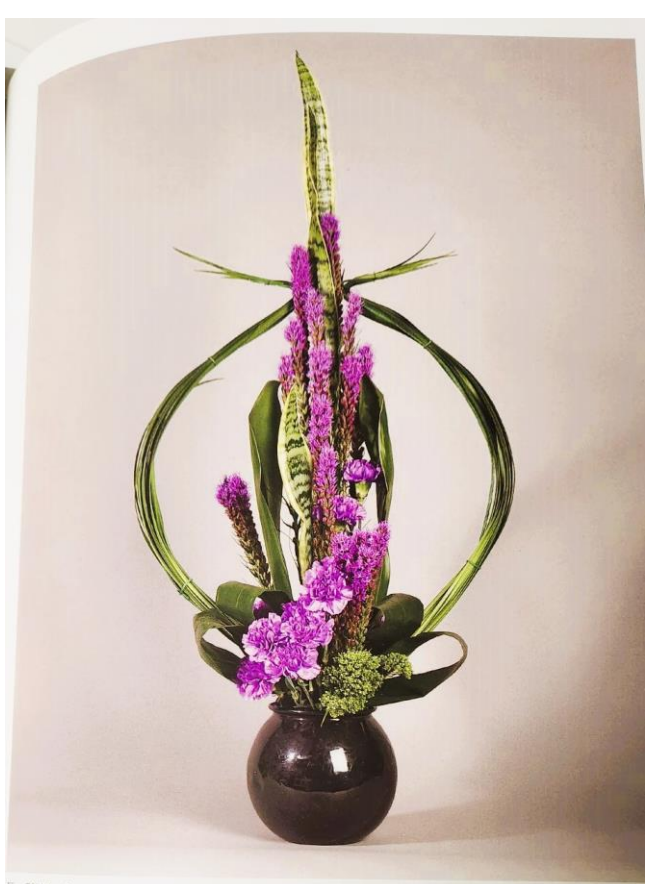
Fig. 79. The design technique of "framing" was applied in the circular movement of broom, which is repeated folded applidstra leaves and round container. A contrasting vertical rhythm is formed from liatris bloon variegated sanseveria foliage, with carnations, folded aspidistra leaves and trachelium adding textural interest both rhythms emerge.